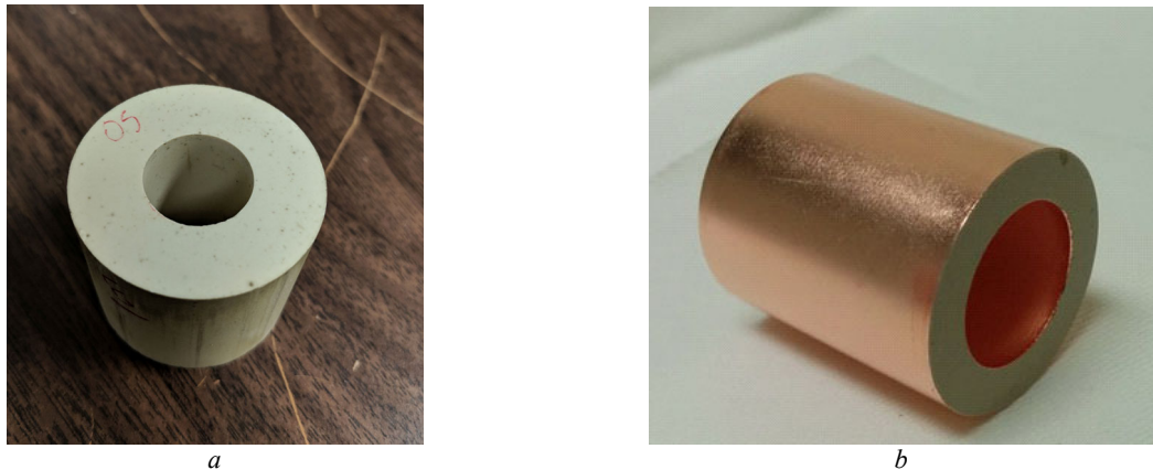
Fig. 3. The tunable BST ferroelectric element for 400 MHz SRF cavity tuner (a); tunable ferroelectric BST element after metallization (b)

sions of low permittivity conventional dielectric material. In particular, the area of possible accelerator applications of ferroelectric elements is broadening. Our collaboration currently has studied two L-band tuner designs, and X-band and Ka-band fast switches and phase shifters [12, 13]. A fast ferroelectric tuner has been designed for operation in L-band to allow rapid adjustments of cavity coupling in an accelerator where RF source fluctuations, microphonics, or other uncontrolled fluctuations could cause undesirable emittance growth. This ferroelectric based device is intended for ERL [11], ILC and PIP-II applications [12, 13].